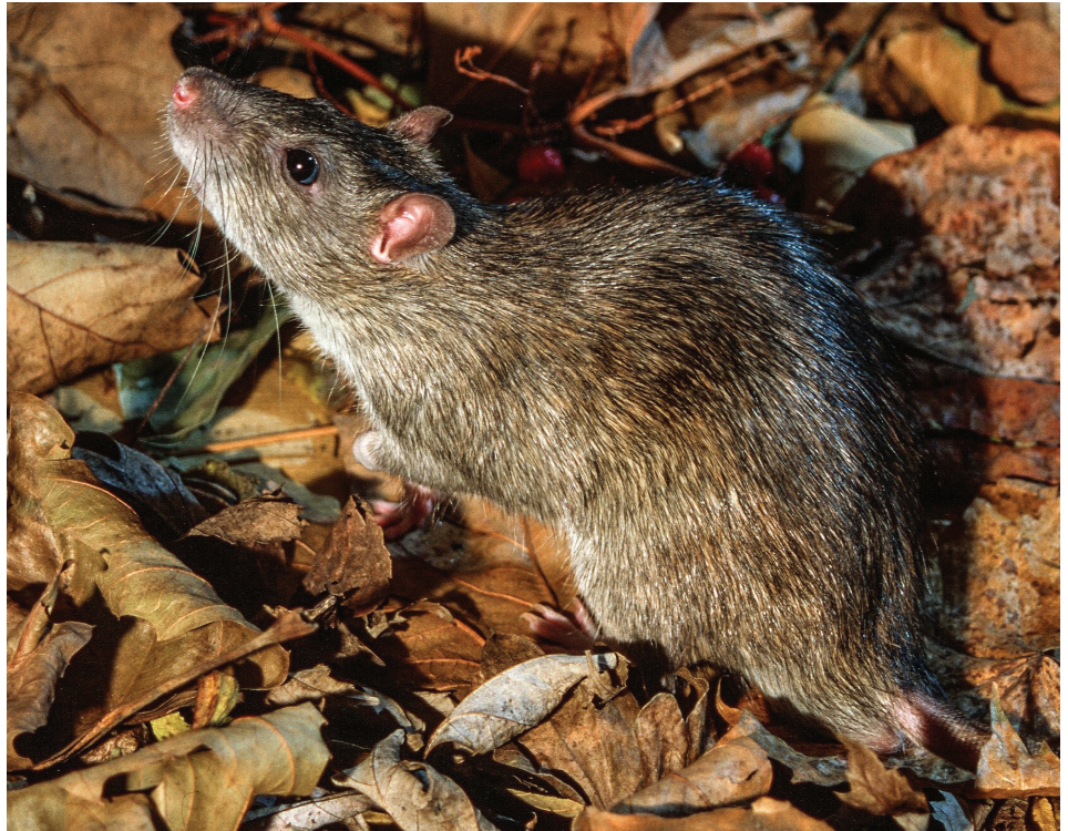
above: Rodents are carriers of at least 45 diseases and 200 human pathogens.

Unfortunately, just a few years after these