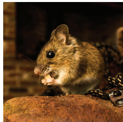
above: Brown rats, Black rats, and mice, respectively, can transmit a wide variety of diseases to humans.